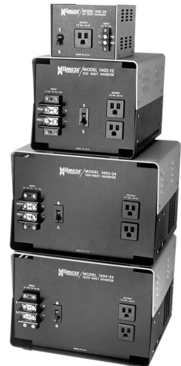
MODELS 1401 TO 1404