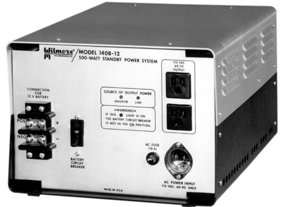
500-VA - MODEL 1408