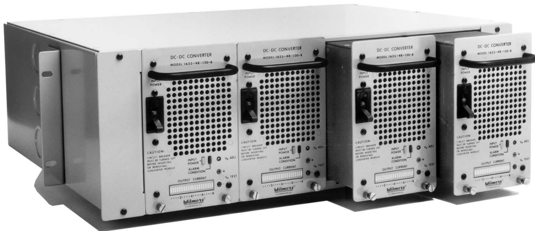
Model 1625-48-130-8 Converter Modules and Model 1625-48-130-SH Power Shelf