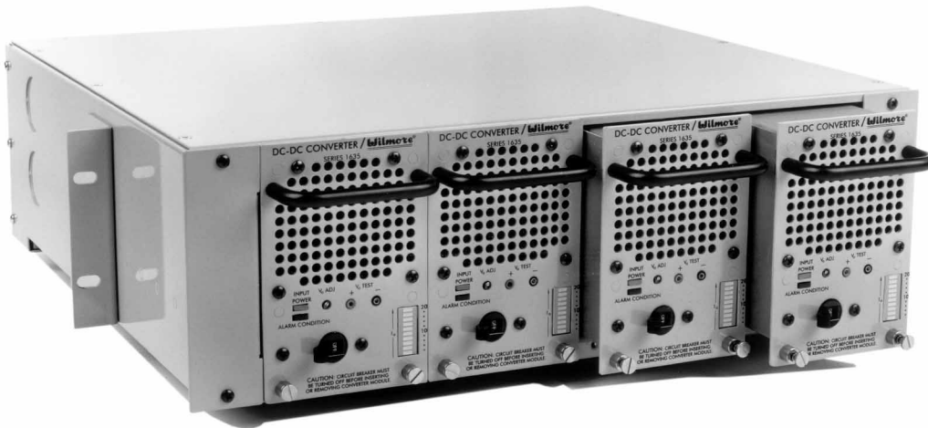
Model 1635-48-24-20 Converter Modules and Model 1635-48-24-S19 Power Shelf